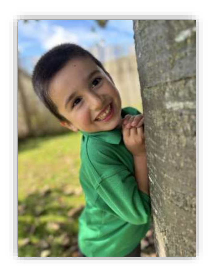
Prospectws / Prospectus 2024 / 2025

Law yn llaw, gyda'n gilydd mi allwn Hand in hand, together we can